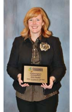
Finalists - Eberts Heating & Cooling, Wishmaker House Bed & Breakfast and Winery, Carousel Works, Featheringham Orthodontics