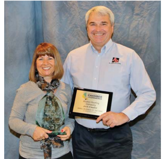
Winners - Richland Source (14 Employees & Under) and Alumni Roofing Co. (15 Employees & Over)