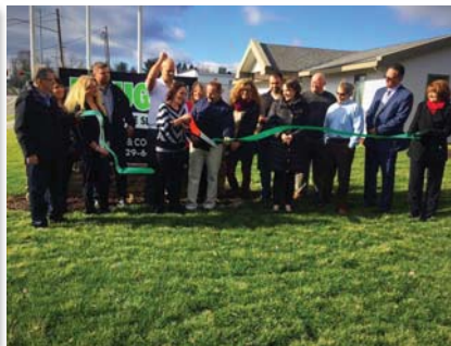
Dzугan Real Estate Service Ribbon Cutting