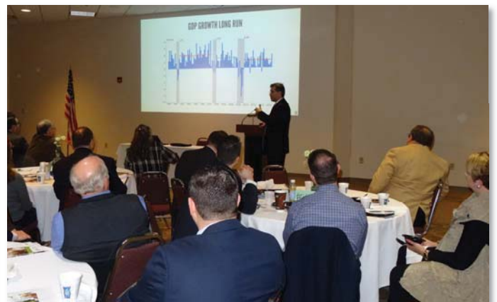
2017 Economic Forecast Breakfast