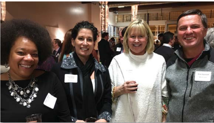
Richland Academy Business After Hours