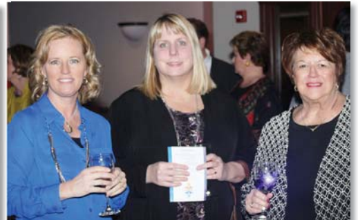
Chamber Annual Meeting & Dinner