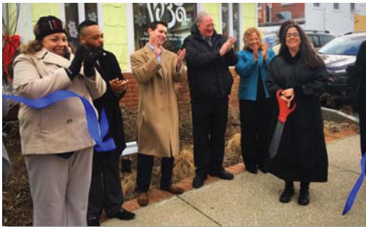
Mind Body Align's Butterfly House Ribbon Cutting